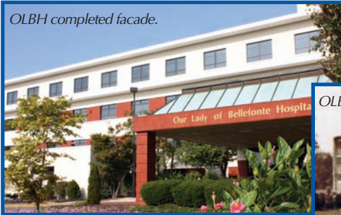
OLBH opened its doors in 1954.