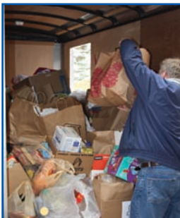
A truck trailer is loaded with supplies donated by OLBH to benefit the Helping Hands organization. In-kind donations are one of the many ways OLBH provides for the community.

Community Benefit Programs - This includes community health services, health professionals education, financial/in-kind contribution and community-building activities.